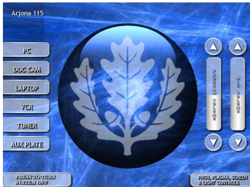
Fig 1 Main Menu